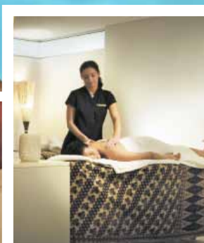
(clockwise from left) The Onsen Ma Japanese baths are worth stepping into; the rustic pool area at Authenticity invites relaxation; a soothing Vie Spa massage.

Just over an hour's drive south of Adelaide is a bastion of serenity where personalised rejuvenation is paramount. Celebrating 150 years, the historical property has